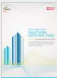
Sentiment Index Report Q4 2015