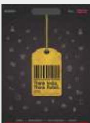
Think India Think Retail 2016