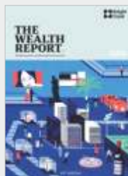
The Wealth Report 2016