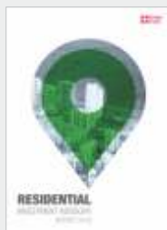
Residential Investment Advisory 2016